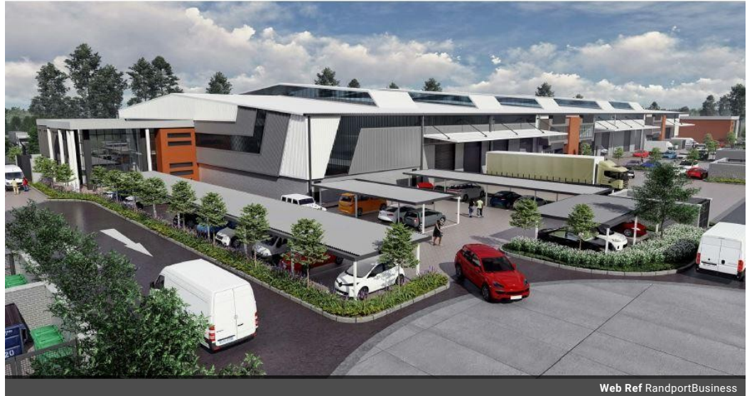
Web Ref RandportBusiness

Office 40A Eden Meadows Complex 1 Van Riebeeck Avenue Greenstone 1609