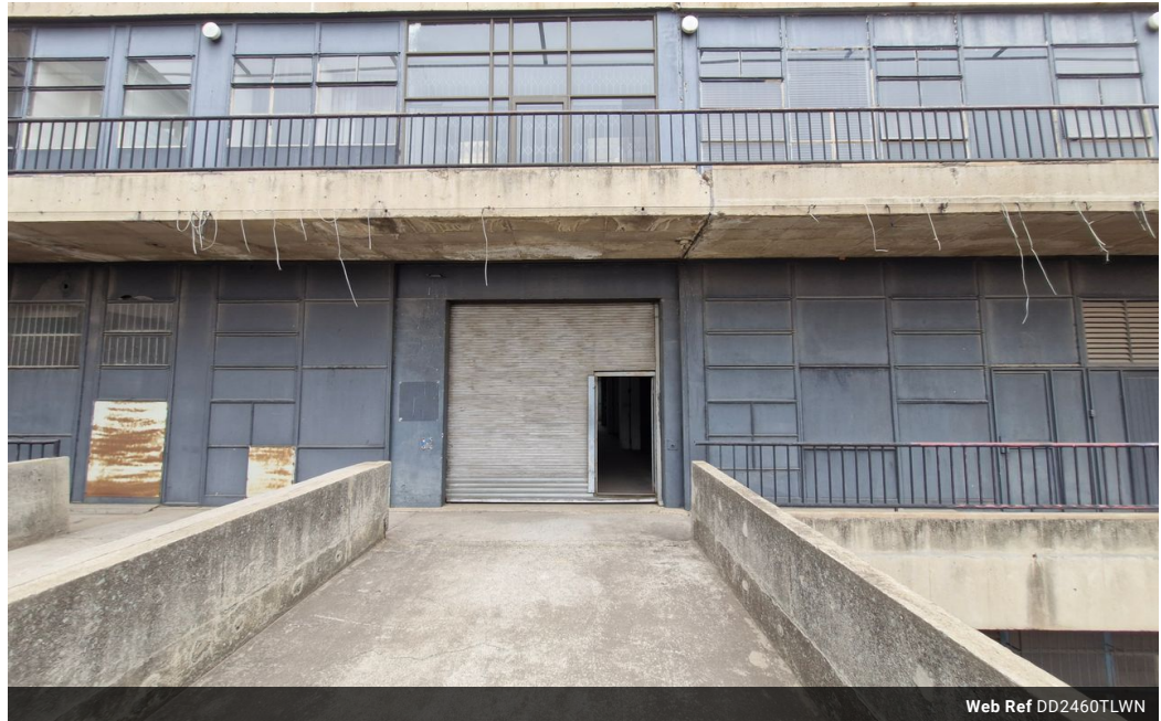
Web Ref DD2460TLWN

Office 40A Eden Meadows Complex 1 Van Riebeeck Avenue Greenstone 1609