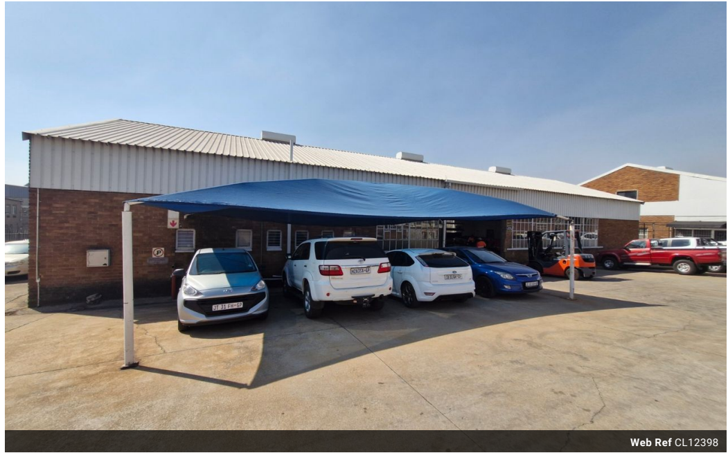
Web Ref CL12398

Office 40A Eden Meadows Complex 1 Van Riebeeck Avenue Greenstone 1609