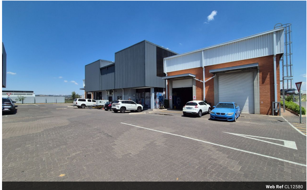
Web Ref CL12580

Office 40A Eden Meadows Complex 1 Van Riebeeck Avenue Greenstone 1609