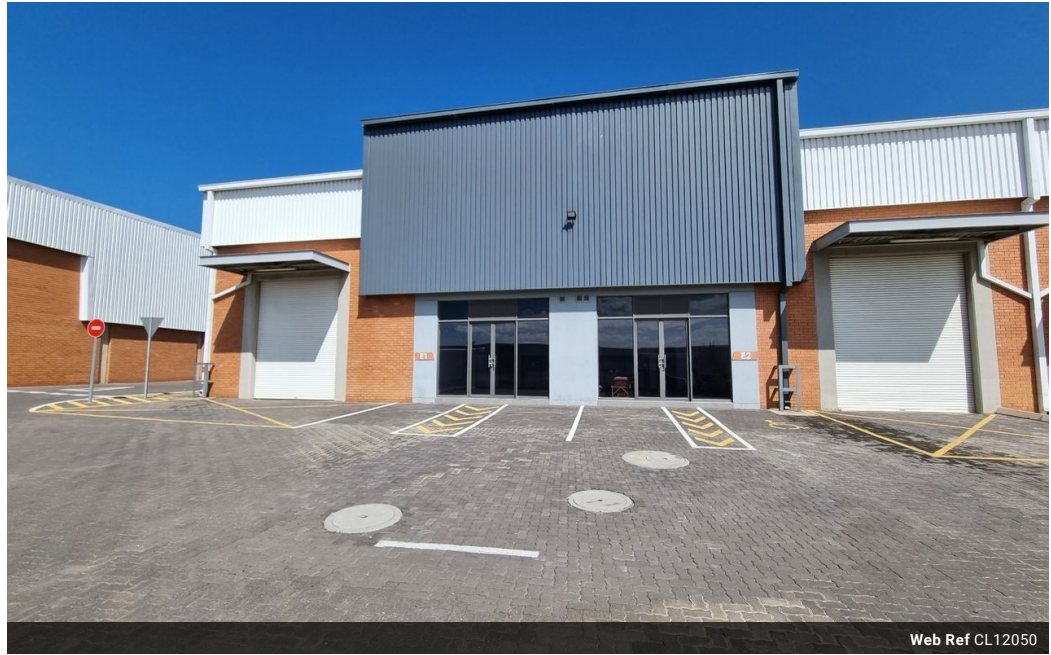
Web Ref CL12050

Office 40A Eden Meadows Complex 1 Van Riebeeck Avenue Greenstone 1609