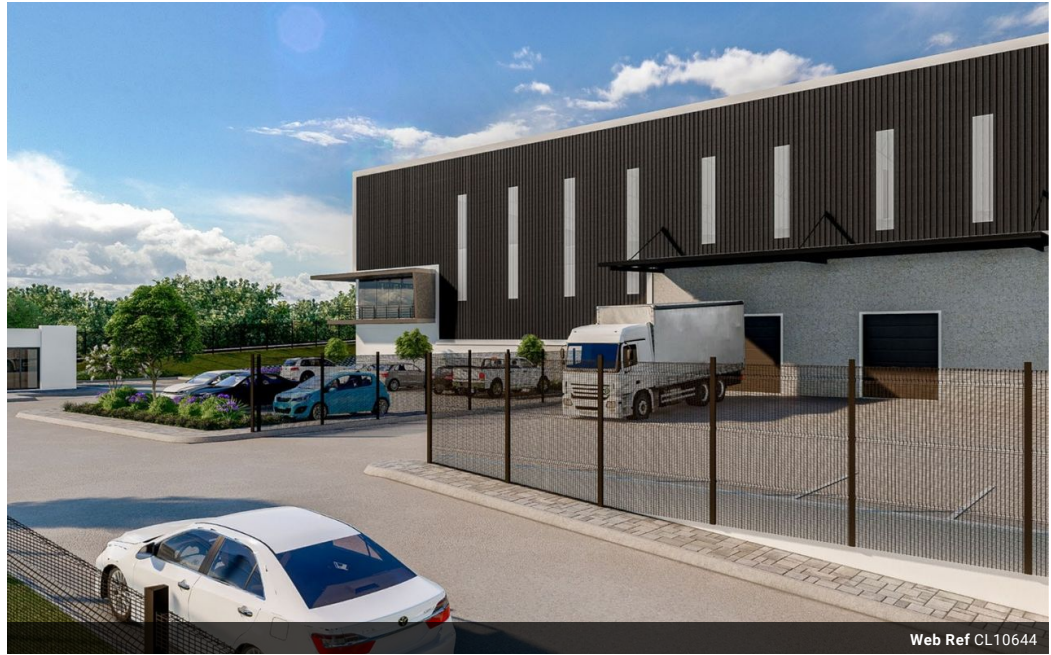
Web Ref CL10644

Office 40A Eden Meadows Complex 1 Van Riebeeck Avenue Greenstone 1609