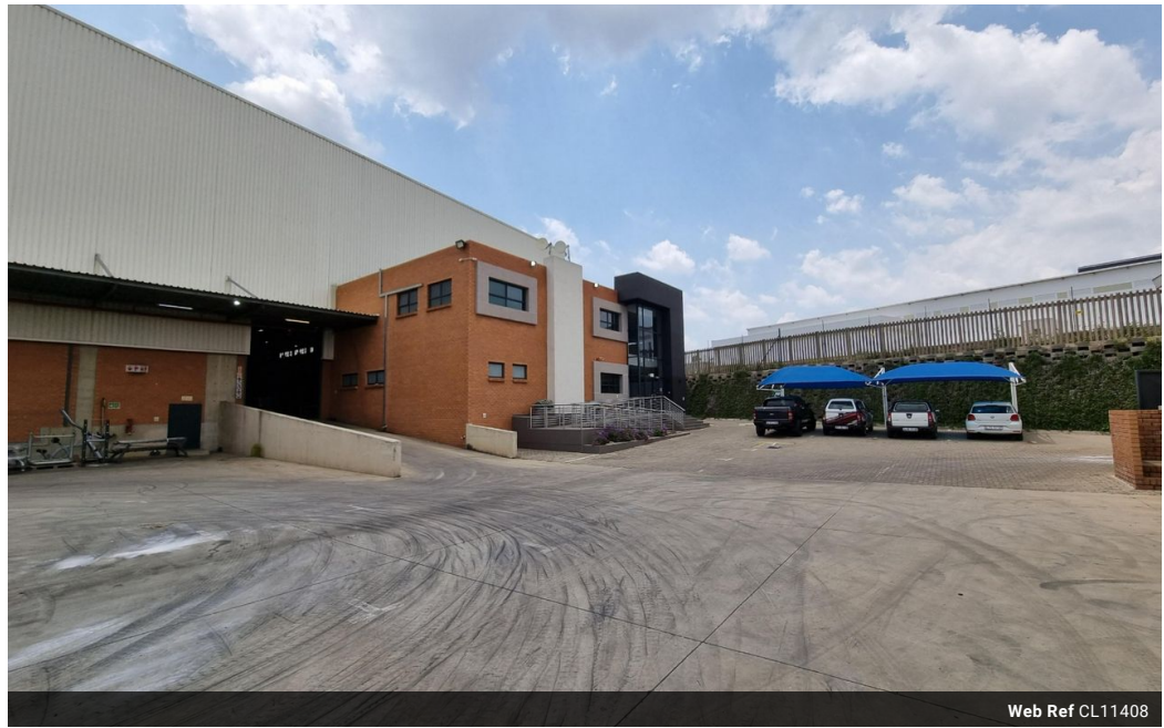
Web Ref CL11408

Office 40A Eden Meadows Complex 1 Van Riebeeck Avenue Greenstone 1609