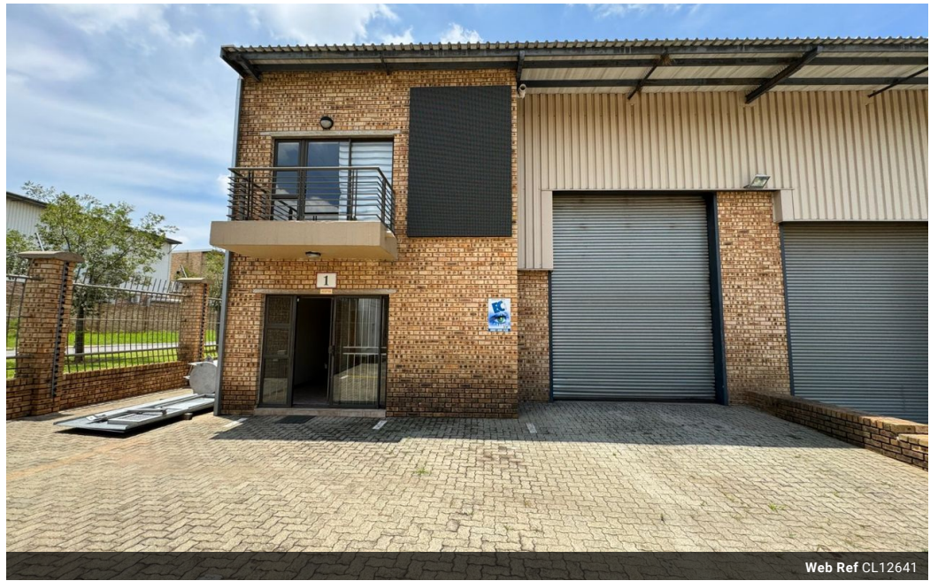
Web Ref CL12641

Office 40A Eden Meadows Complex 1 Van Riebeeck Avenue Greenstone 1609