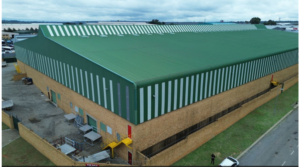
Web Ref RVR14600TLST

Office 40A Eden Meadows Complex 1 Van Riebeeck Avenue Greenstone 1609