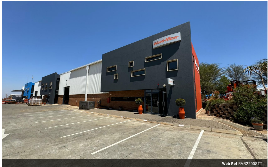
Web Ref RVR2200STLL

Office 40A Eden Meadows Complex 1 Van Riebeeck Avenue Greenstone 1609