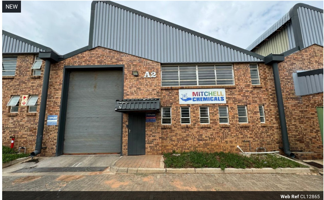
Web Ref CL12865

Office 40A Eden Meadows Complex 1 Van Riebeeck Avenue Greenstone 1609