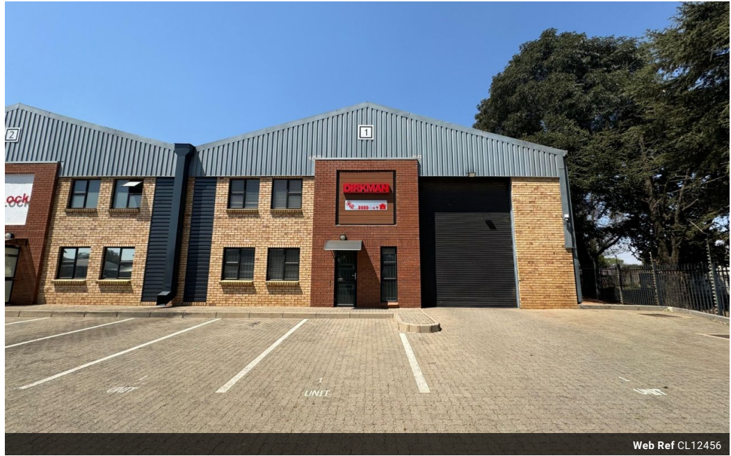
Web Ref CL12456

Office 40A Eden Meadows Complex 1 Van Riebeeck Avenue Greenstone 1609