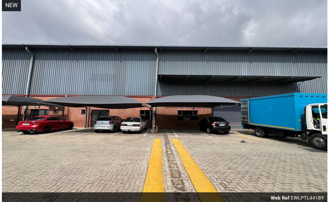
Web Ref EWLPTL441B9

Office 40A Eden Meadows Complex 1 Van Riebeeck Avenue Greenstone 1609