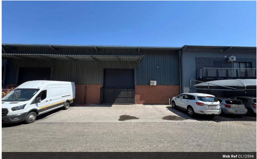
Web Ref CL12594

Office 40A Eden Meadows Complex 1 Van Riebeeck Avenue Greenstone 1609