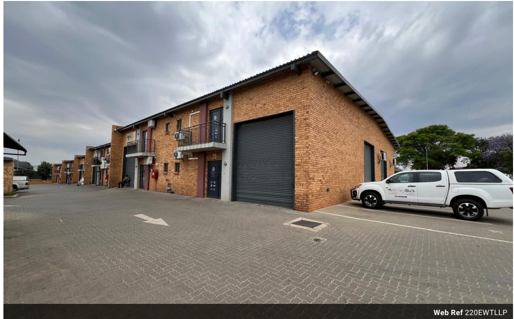
Web Ref 220EWTLPP

Office 40A Eden Meadows Complex 1 Van Riebeeck Avenue Greenstone 1609