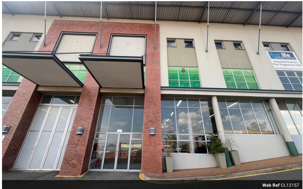
Web Ref CL12157

Office 40A Eden Meadows Complex 1 Van Riebeeck Avenue Greenstone 1609