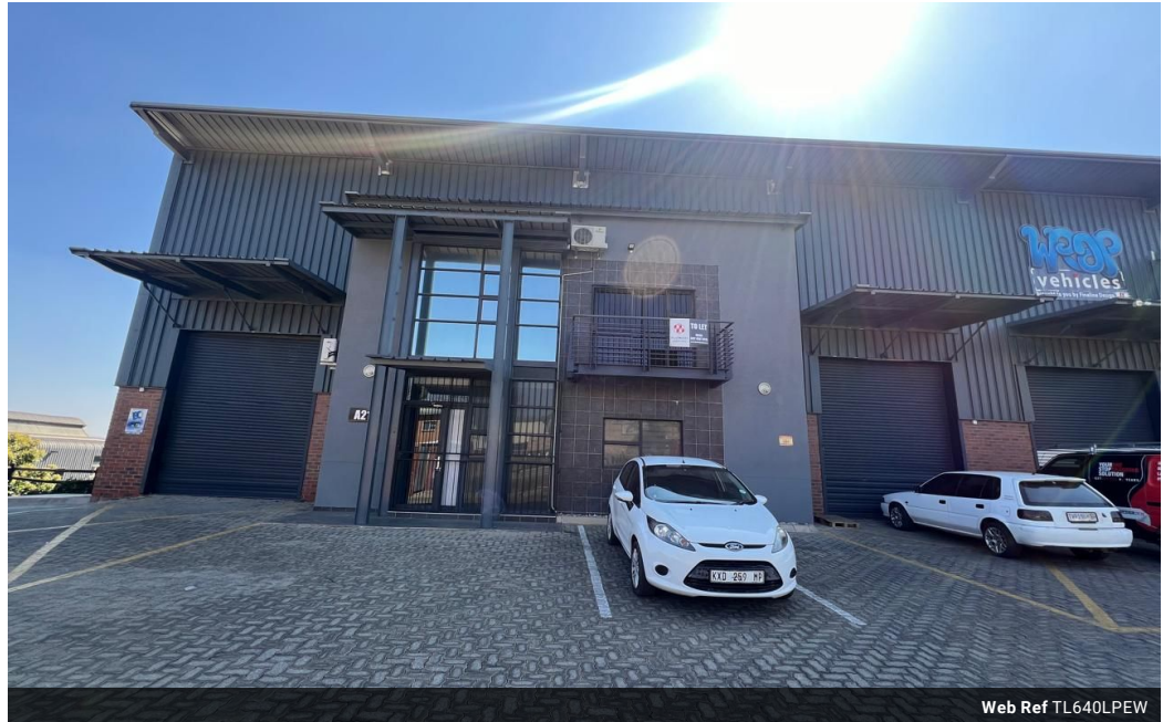
Web Ref TL640LPEW

Office 40A Eden Meadows Complex 1 Van Riebeeck Avenue Greenstone 1609