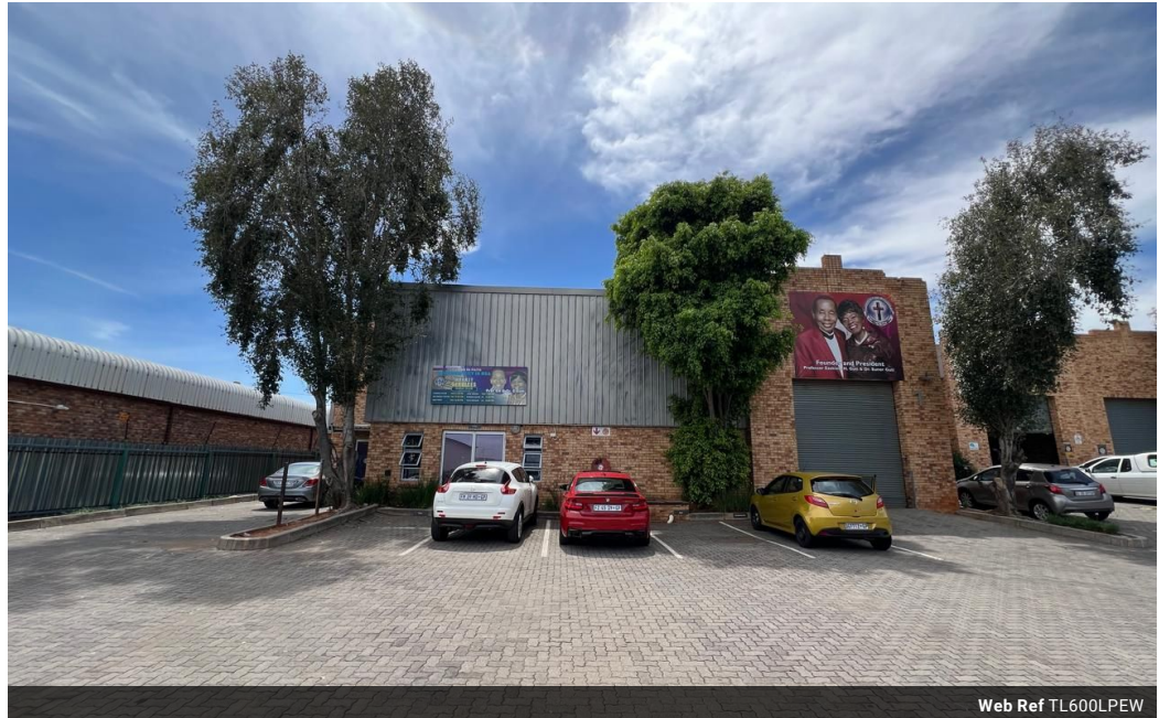
Web Ref TL600LPEW

Office 40A Eden Meadows Complex 1 Van Riebeeck Avenue Greenstone 1609