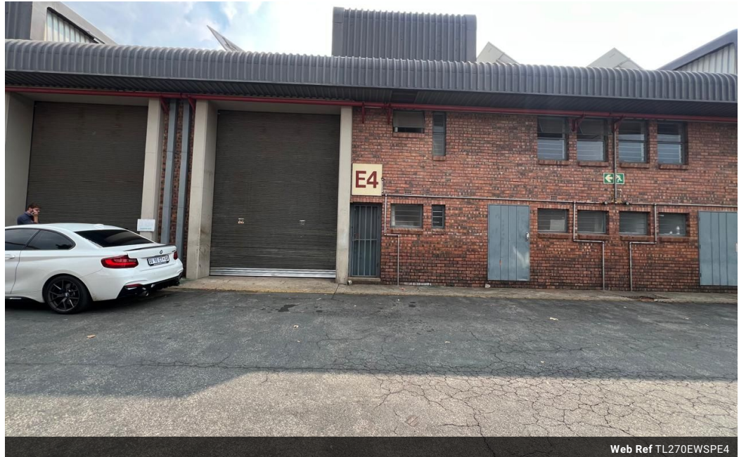
Web Ref TL270EWSPE4

Office 40A Eden Meadows Complex 1 Van Riebeeck Avenue Greenstone 1609