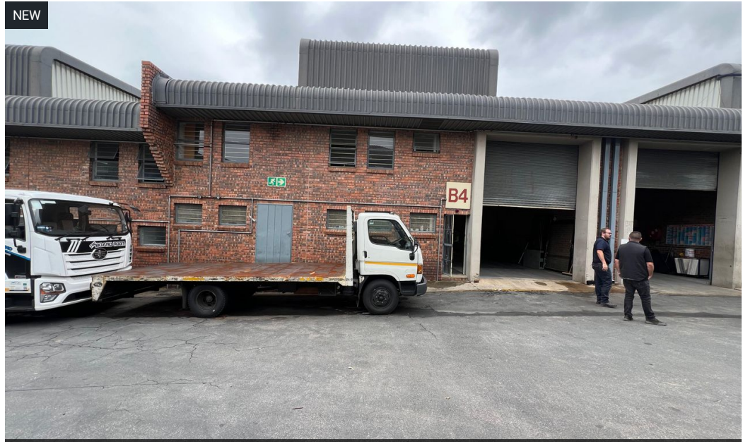
Web Ref EWSPTL398

Office 40A Eden Meadows Complex 1 Van Riebeeck Avenue Greenstone 1609