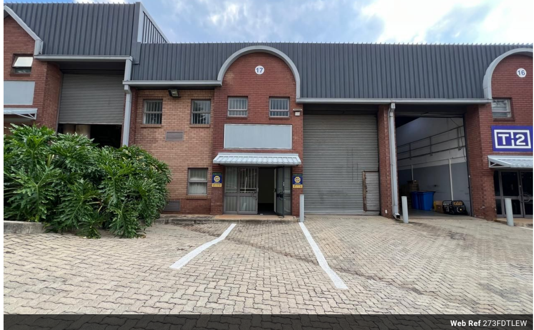
Web Ref 273FDTLEW

Office 40A Eden Meadows Complex 1 Van Riebeeck Avenue Greenstone 1609