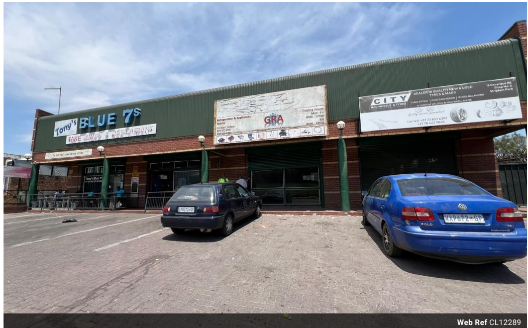
Web Ref CL12289

Office 40A Eden Meadows Complex 1 Van Riebeeck Avenue Greenstone 1609