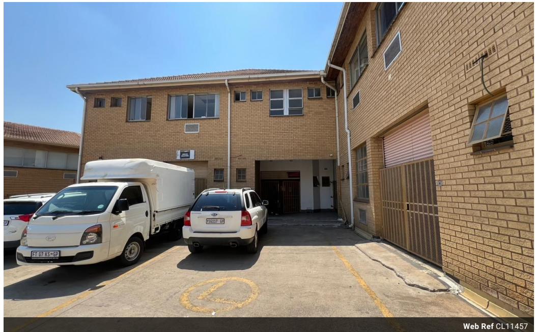
Web Ref CL11457

Office 40A Eden Meadows Complex 1 Van Riebeeck Avenue Greenstone 1609