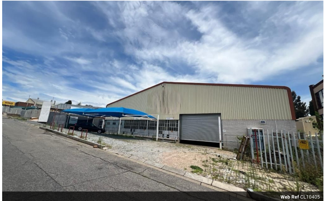
Web Ref CL10405

Office 40A Eden Meadows Complex 1 Van Riebeeck Avenue Greenstone 1609