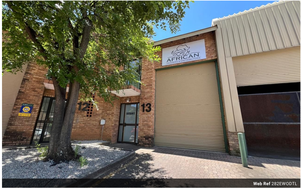
Web Ref 282EWDTL

Office 40A Eden Meadows Complex 1 Van Riebeeck Avenue Greenstone 1609