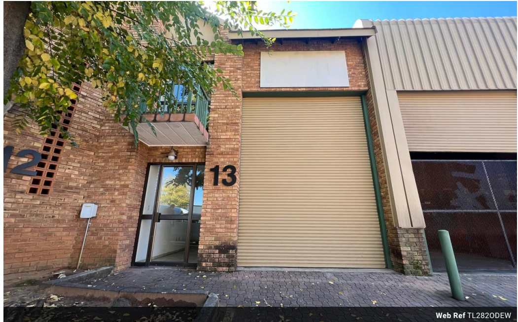
Web Ref TL2820DEW

Office 40A Eden Meadows Complex 1 Van Riebeeck Avenue Greenstone 1609