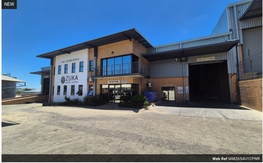
Web Ref MM2654U1CPNR

Office 40A Eden Meadows Complex 1 Van Riebeeck Avenue Greenstone 1609