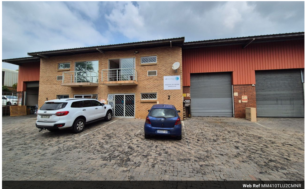
Web Ref MM410TLU2CMNR

Office 40A Eden Meadows Complex 1 Van Riebeeck Avenue Greenstone 1609