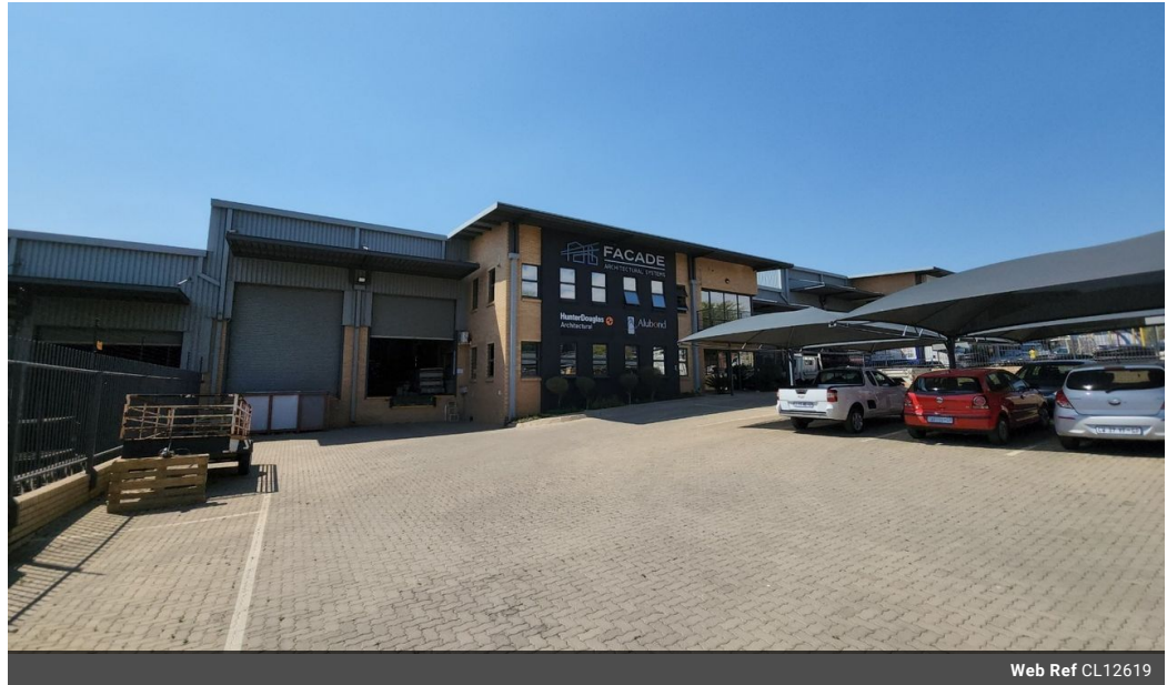
Web Ref CL12619

Office 40A Eden Meadows Complex 1 Van Riebeeck Avenue Greenstone 1609