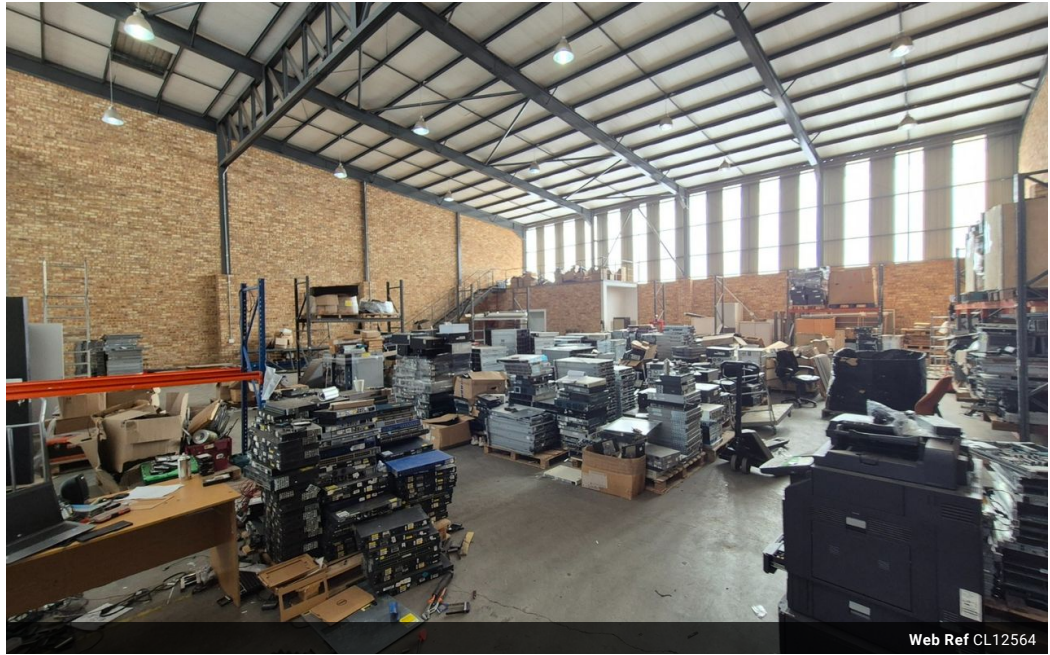
Web Ref CL12564

Office 40A Eden Meadows Complex 1 Van Riebeeck Avenue Greenstone 1609