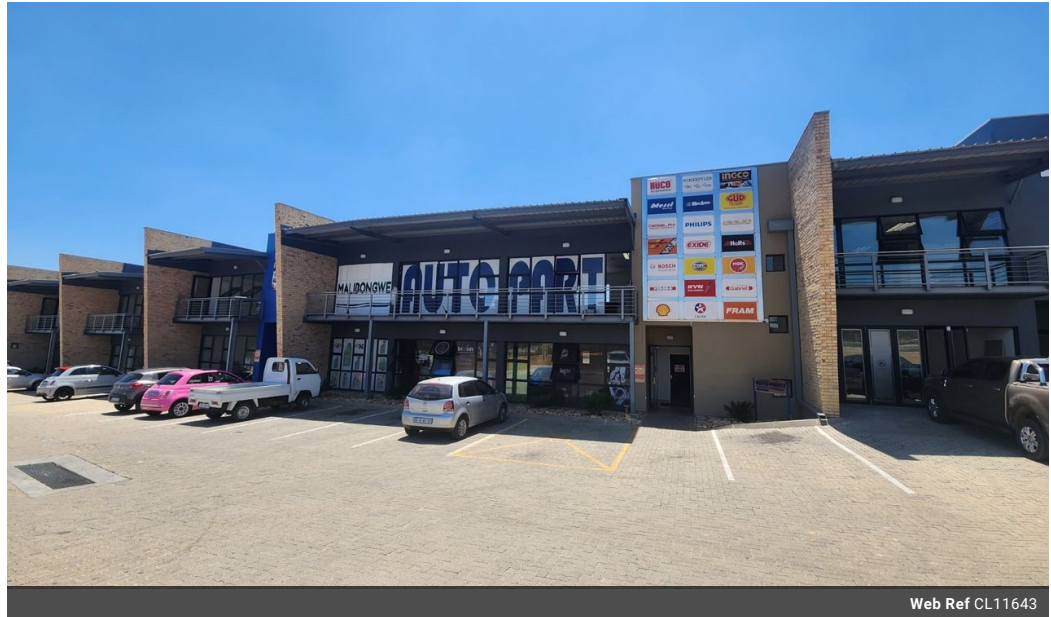
Web Ref CL11643

Office 40A Eden Meadows Complex 1 Van Riebeeck Avenue Greenstone 1609