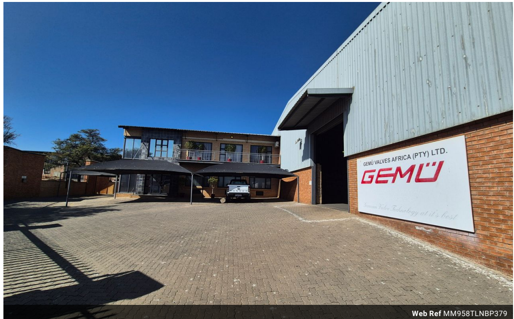
Web Ref MM958TLNBP379

Office 40A Eden Meadows Complex 1 Van Riebeeck Avenue Greenstone 1609