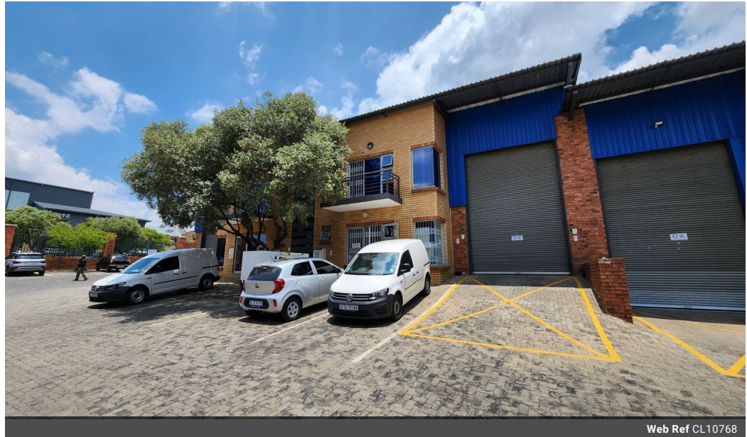
Web Ref CL10768

Office 40A Eden Meadows Complex 1 Van Riebeeck Avenue Greenstone 1609