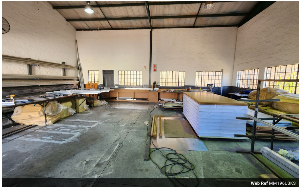
Web Ref MM196U3KS

Office 40A Eden Meadows Complex 1 Van Riebeeck Avenue Greenstone 1609