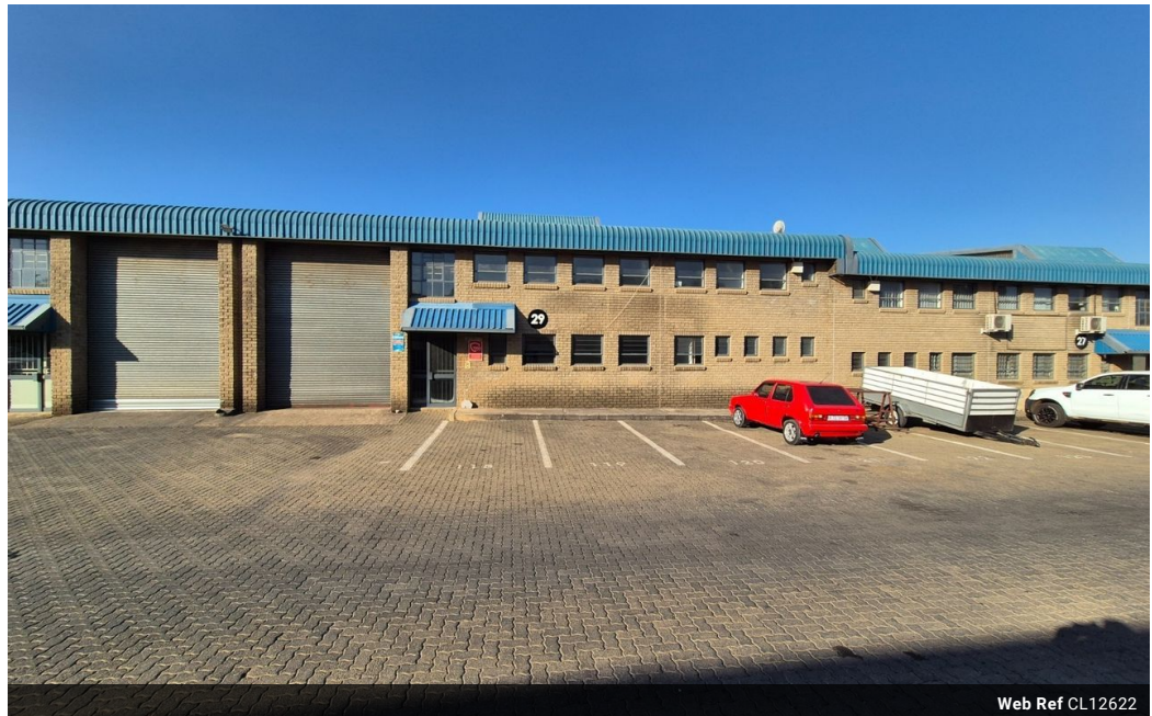
Web Ref CL12622

Office 40A Eden Meadows Complex 1 Van Riebeeck Avenue Greenstone 1609