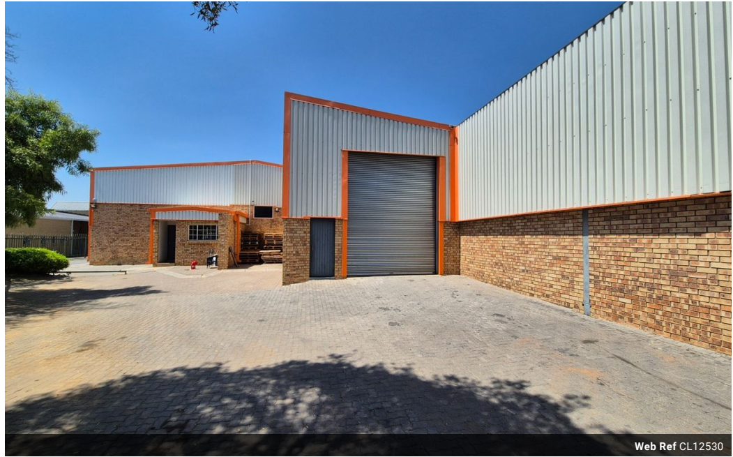
Web Ref CL12530

Office 40A Eden Meadows Complex 1 Van Riebeeck Avenue Greenstone 1609