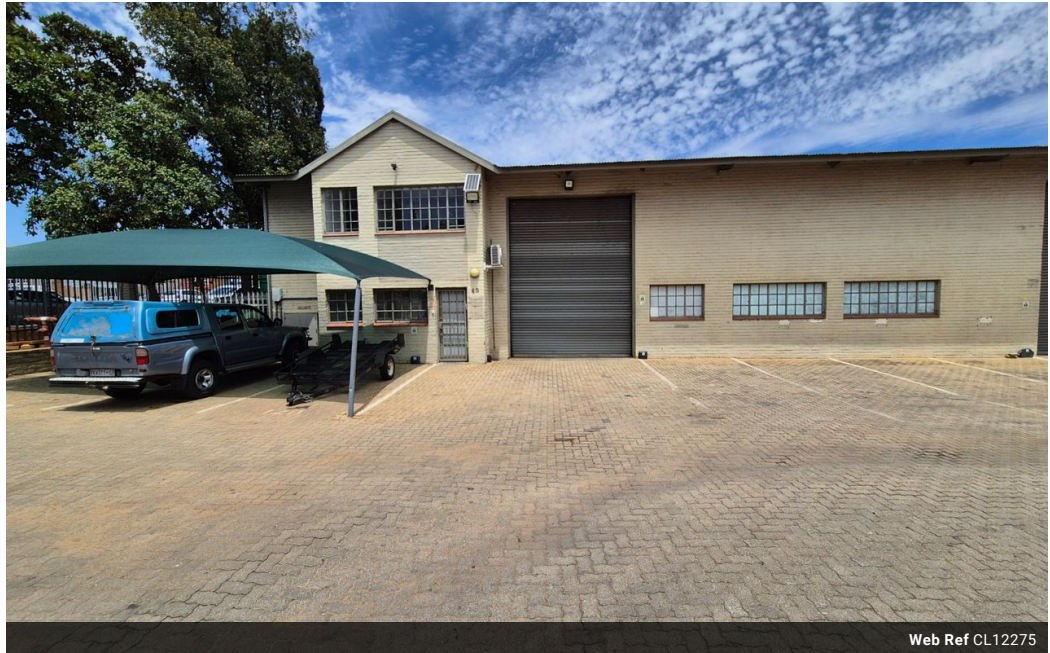
Web Ref CL12275

Office 40A Eden Meadows Complex 1 Van Riebeeck Avenue Greenstone 1609