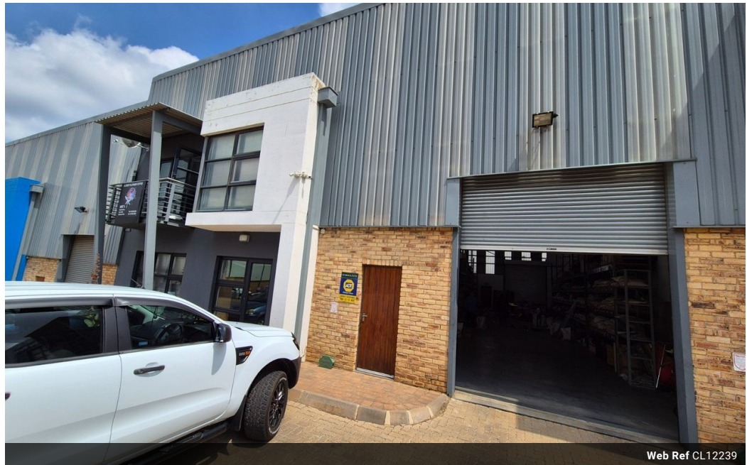
Web Ref CL12239

Office 40A Eden Meadows Complex 1 Van Riebeeck Avenue Greenstone 1609