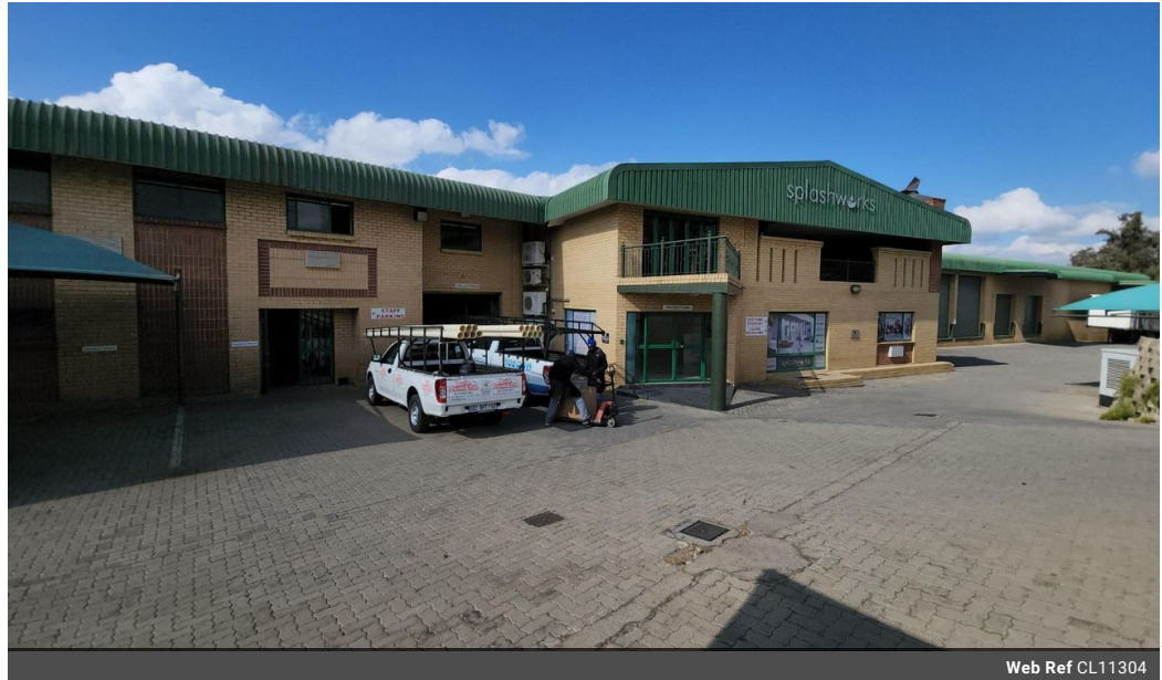
Web Ref CL11304

Office 40A Eden Meadows Complex 1 Van Riebeeck Avenue Greenstone 1609