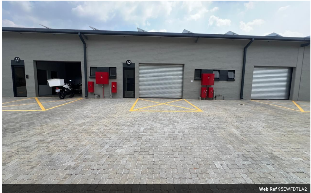
Web Ref 95EWFDTLA2

Office 40A Eden Meadows Complex 1 Van Riebeeck Avenue Greenstone 1609