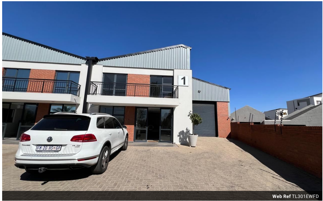
Web Ref TL301EWFD

Office 40A Eden Meadows Complex 1 Van Riebeeck Avenue Greenstone 1609