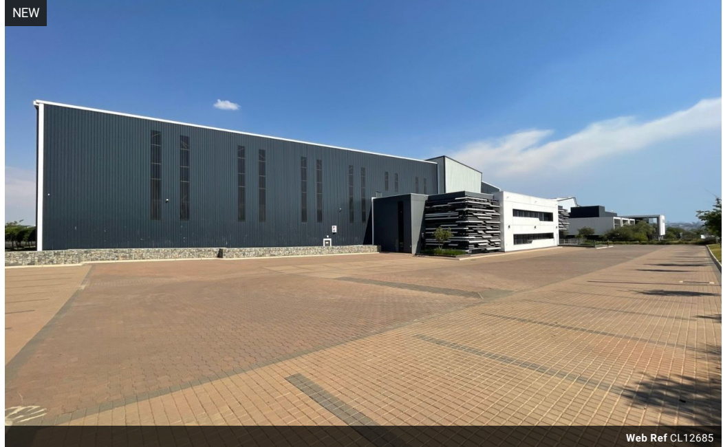
Web Ref CL12685

Office 40A Eden Meadows Complex 1 Van Riebeeck Avenue Greenstone 1609