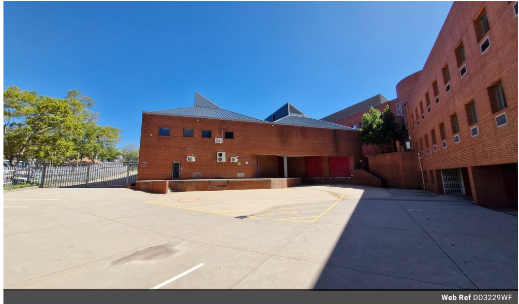
Web Ref DD3229WF

Office 40A Eden Meadows Complex 1 Van Riebeeck Avenue Greenstone 1609