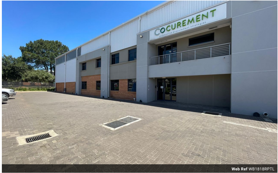
Web Ref WB1818RPTL

Office 40A Eden Meadows Complex 1 Van Riebeeck Avenue Greenstone 1609