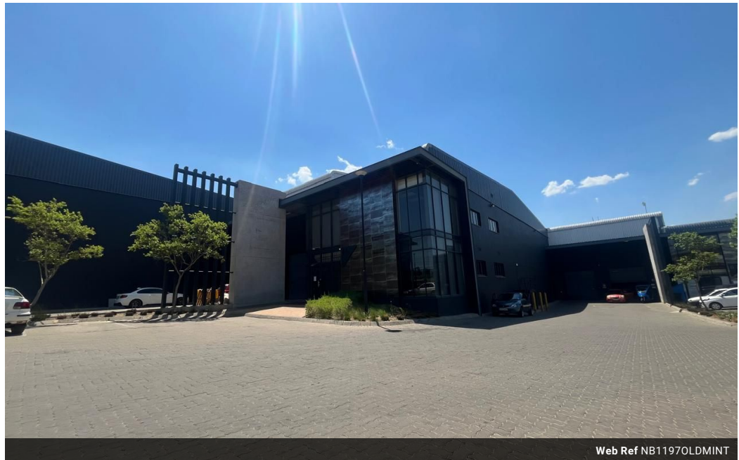
Web Ref NB1197OLDMINT

Office 40A Eden Meadows Complex 1 Van Riebeeck Avenue Greenstone 1609