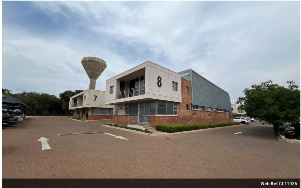
Web Ref CL11936

Office 40A Eden Meadows Complex 1 Van Riebeeck Avenue Greenstone 1609