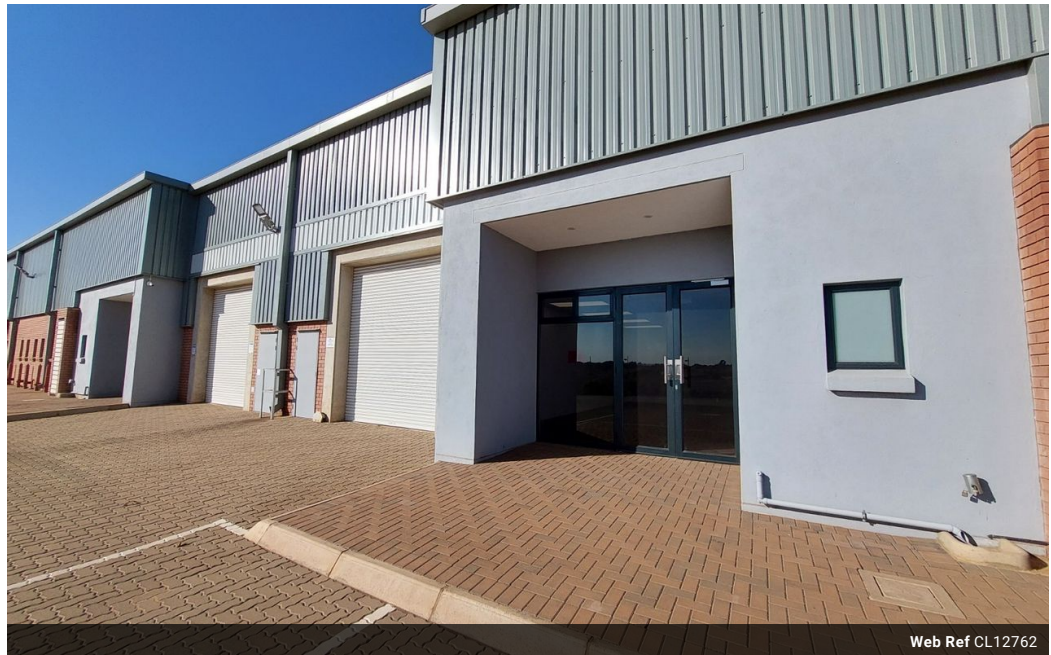
Web Ref CL12762

Office 40A Eden Meadows Complex 1 Van Riebeeck Avenue Greenstone 1609