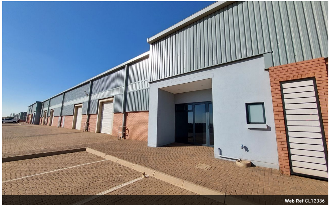
Web Ref CL12386

Office 40A Eden Meadows Complex 1 Van Riebeeck Avenue Greenstone 1609