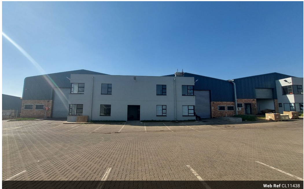
Web Ref CL11438

Office 40A Eden Meadows Complex 1 Van Riebeeck Avenue Greenstone 1609