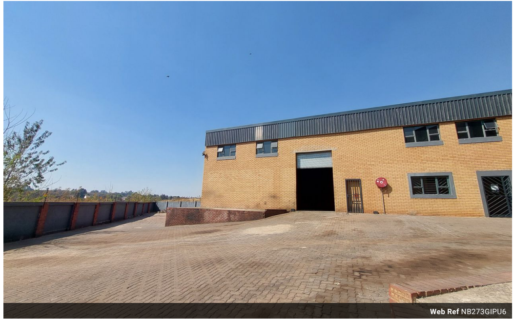
Web Ref NB273GIPU6

Office 40A Eden Meadows Complex 1 Van Riebeeck Avenue Greenstone 1609